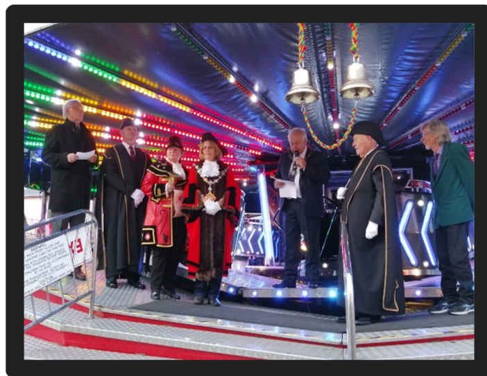
Pembroke Michaelmas Fair