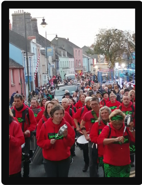
Samba Doc (Local Band) parading at the Start of Michaelmas Fair