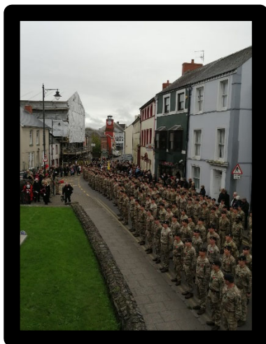
Over 200 Soldiers & local groups joining us for Remembrance Day Parade