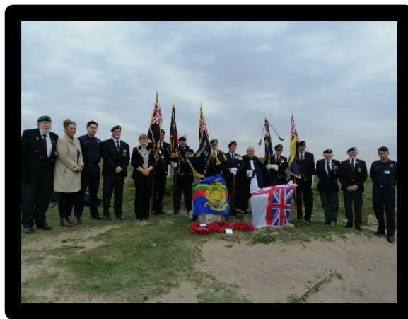
Remembering those who lost their lives in the Landing Craft Disaster at Freshwater West